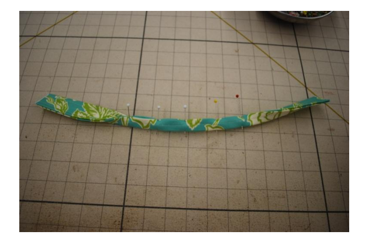
Fold in half again and pin