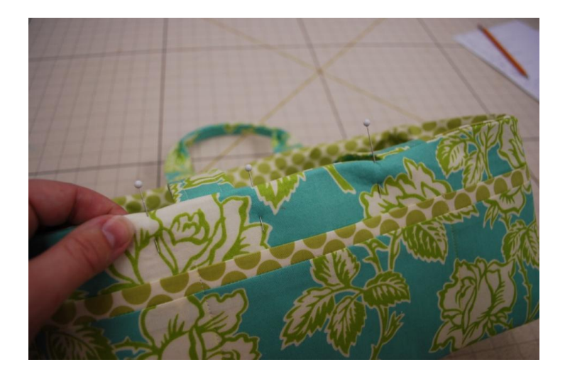
Turn right side out through the opening in the lining and press. Pin top edge and topstitch ¼" all the way around the top edge. Sew the opening in the lining closed.