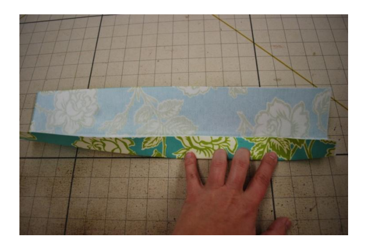
Open handle and fold each side in toward center and press