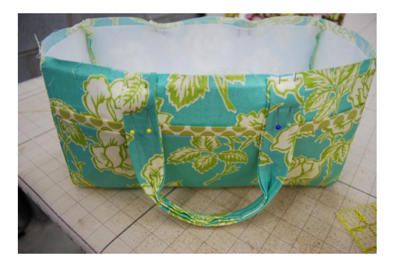
Apply Handles to each side. Place handles centered on long side of caddy, positioned 3.5" apart. Baste using a ¼" seam.