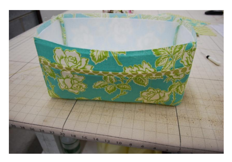
Turn exterior right side out.