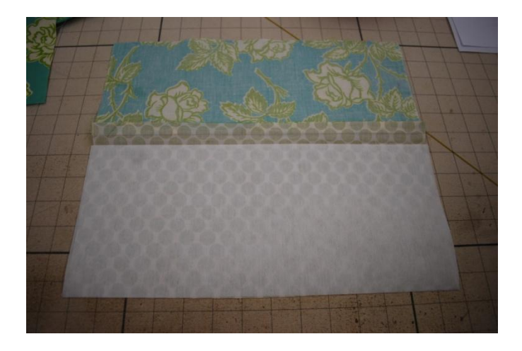
Open pocket and place Décor Bond between the layers. Press to fuse.

Fuse the Décor Bond to the Lining Front, Back and Sides.