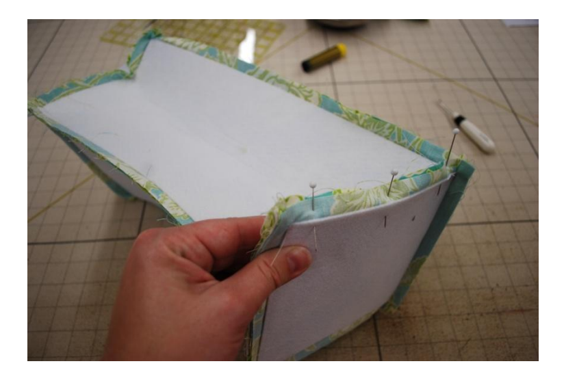
Repeat process on sides. Make sure to start and stop sewing ½" from each end, backstitching at each end.