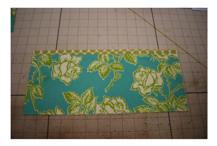
To form pocket, fold in half (wrong sides together) and press