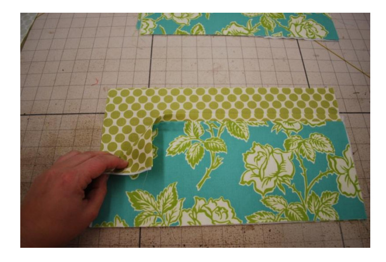
Layer pocket onto Lining Front aligning layers along the bottom edge. Pin in place.