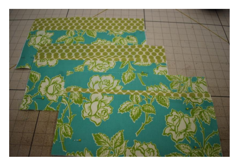
Repeat above step for the Lining Back and Exterior Front. Baste along sides and bottom.