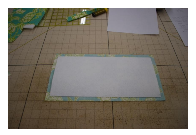
Step 4: Sew Exterior Together

Fuse Peltex to exterior front, back, sides and bottom. Center Peltex on each piece leaving ½" all the way around