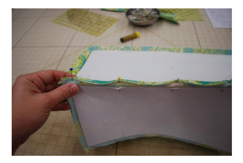
Repeat on opposite side.