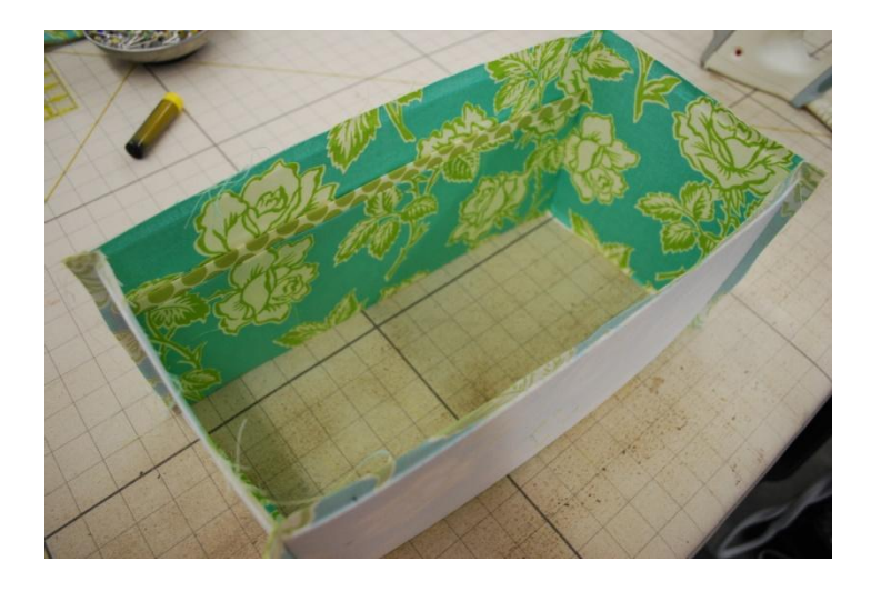
You should now have something that looks like this.