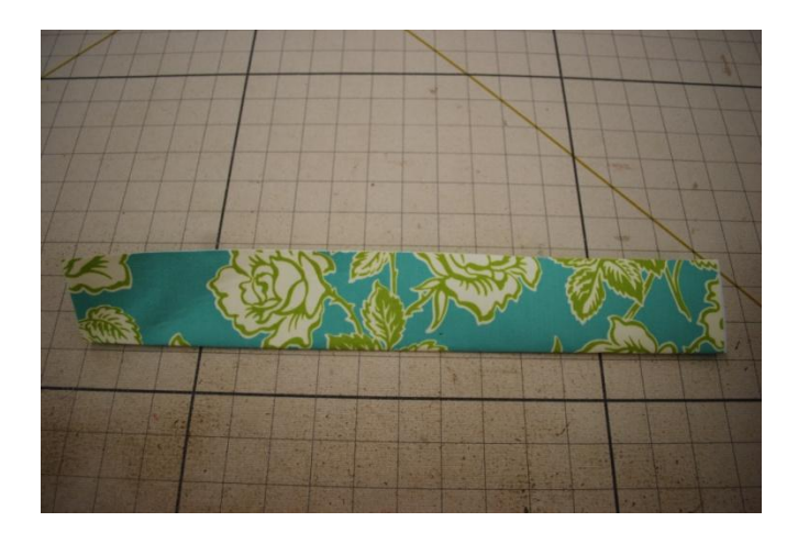
Fold Handle in half lengthwise and press