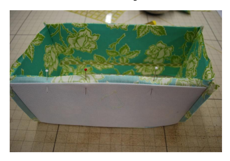
Pin exterior bottom to long side of exterior front, right sides together and sew beginning and ending ½" from each end. Backstitch.