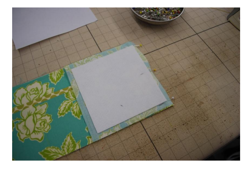
Pin exterior front to exterior side and sew stopping ½" from the bottom edge. Backstitch at each end.