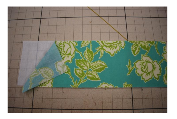
Fuse the Décor Bond to Handle Fabric