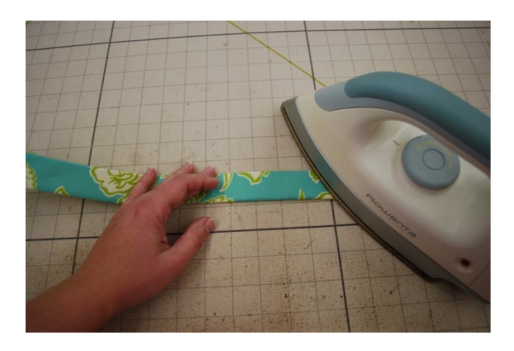
Fold in half again and press