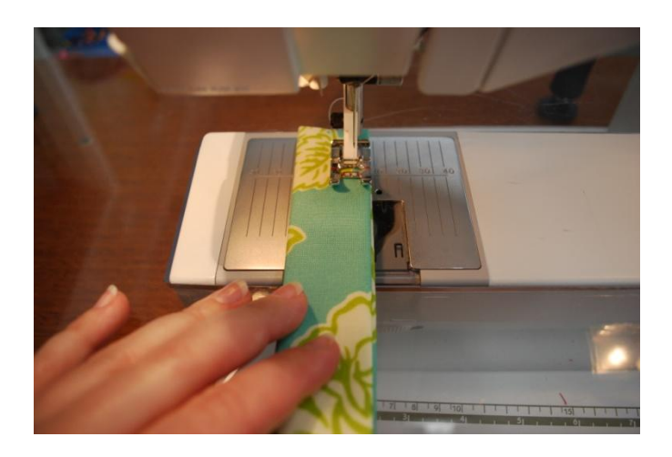
Topstitch a ¼" seam on each long side of handle