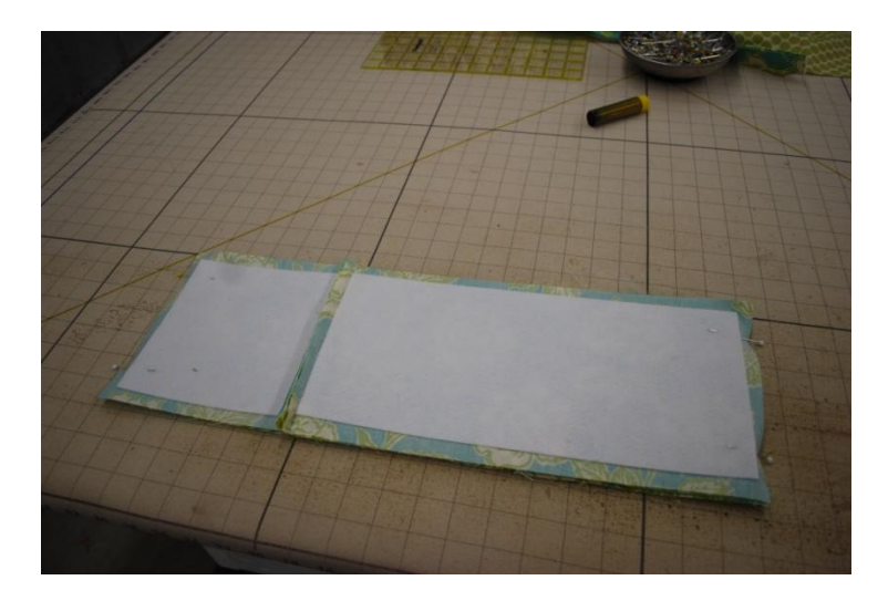
Sew these two pieces together making sure to stop \frac{1}{2} " from bottom edge and backstitching at each end.