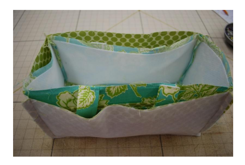
Step 5: Final Assembly

Place caddy exterior into lining, right sides together. Match up seams and pin. Sew using ½" seam.