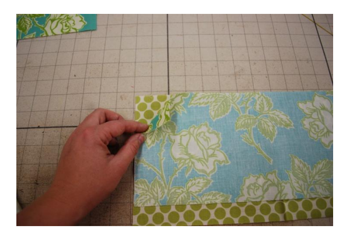
Step 3: Assemble Pockets

Place pocket exterior and pocket lining right sides together matching up fabrics along one long edge