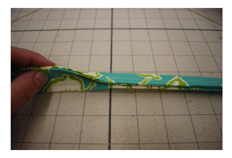
Repeat Steps for other Handle. Handles should look like picture above. Set Handles aside.