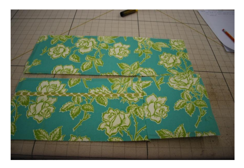
Repeat step for exterior back and other side.