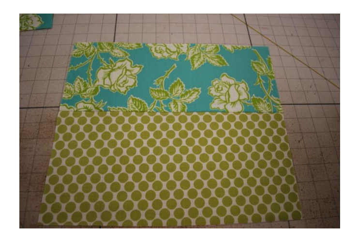
Sew together and press open